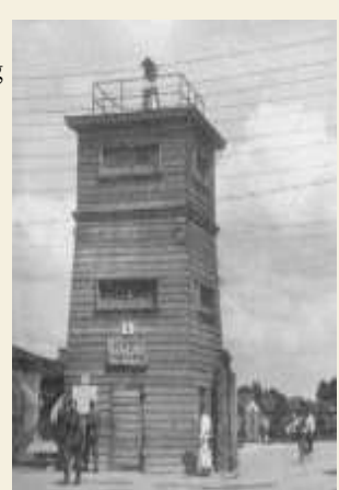
Tower at Stalag VII-A

Reading the accounts of former POWs is difficult, but necessary. The deprivation, brutality and suffering endured by these courageous men and women is so severe that readers must periodically remind themselves that this