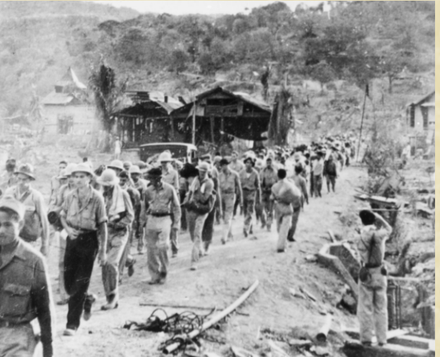
Bataan Death March, American POWs marching north to San Fernando

overloaded with prisoners that more men perished from suffocation and heat exhaustion. Another seven-(Continued on page 2)