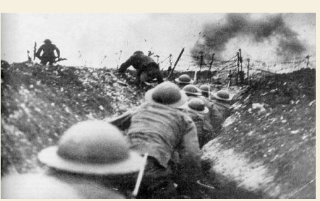
One of the defining features of WWI: Trench Warfare

For much of the war U.S. policy was one of non-intervention. Even after the passenger ship Lusitania was sunk by German U-boats in 1915, Presi-