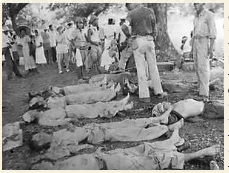
Soldiers who perished during the Bataan Death March

(Continued from page 1) mile march brought the survivors to Camp O'Donnell, where some of the prisoners were formed into work details, while others were loaded on to ships and