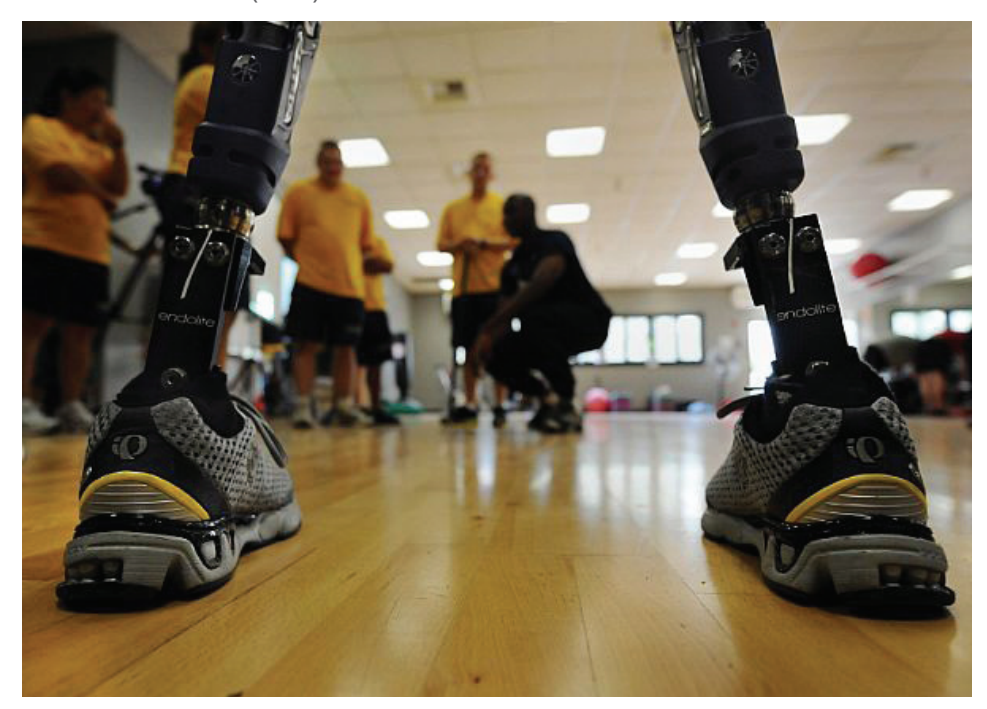
TSGLI covers a range of losses including amputations; limb salvage; paralysis; burns; loss of sight, hearing, or speech; facial reconstruction; 15-day continuous hospitalization; coma; and loss of activities of daily living due to traumatic brain injury or other traumatic injuries.

For more information on TSGLI and a complete list of qualifying losses, go to www. insurance.va.gov/sgliSite/TSGLI/TSGLI.htm. * * * *