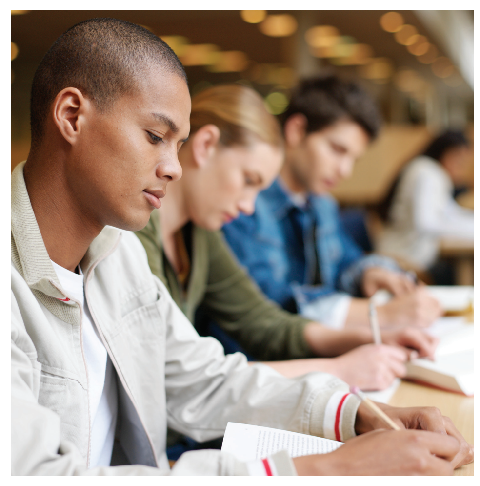
Several changes to the Post 9/11 GI Bill went into effect Aug. 1, while others will not be effective until the beginning of the new fiscal year, Oct. 1.