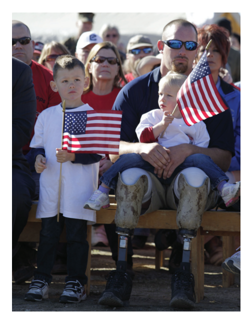
Since the inception of the PDBR, just over 2,500 Veterans have applied to have their records reviewed, with more than 50 percent of cases resulting in a disability retirement.

Since the inception of the PDBR, just over 2,500 Veterans have applied to have their records reviewed, with more than 50 percent of cases resulting in a disability retirement. If a disability retirement is awarded to a Veteran as a result of the review process, it may not result in an immediate monetary gain. Previously awarded payments from the VA and DoD related to