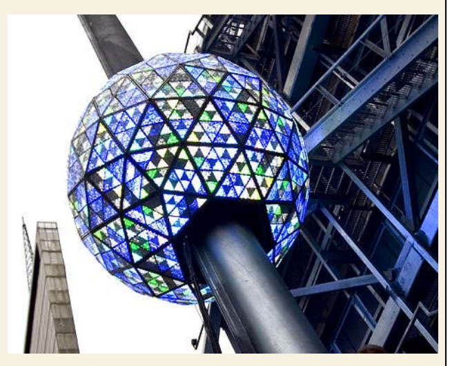
Wishing Everyone a Safe and Prosperous New Year!

810 Vermont Ave, N.W. Washington, DC 20420