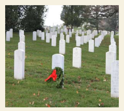
Grave with wreath in Arlington National Cemetery

33 just to the left of the walking path. He will be easy to find just look for the sea shells -Tammy Hurley