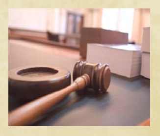
draw from, and VA plays a critical role in assisting the court, and its Veteran partici-(Continued on page 2)

Judge Russell's court has a wealth of resources to